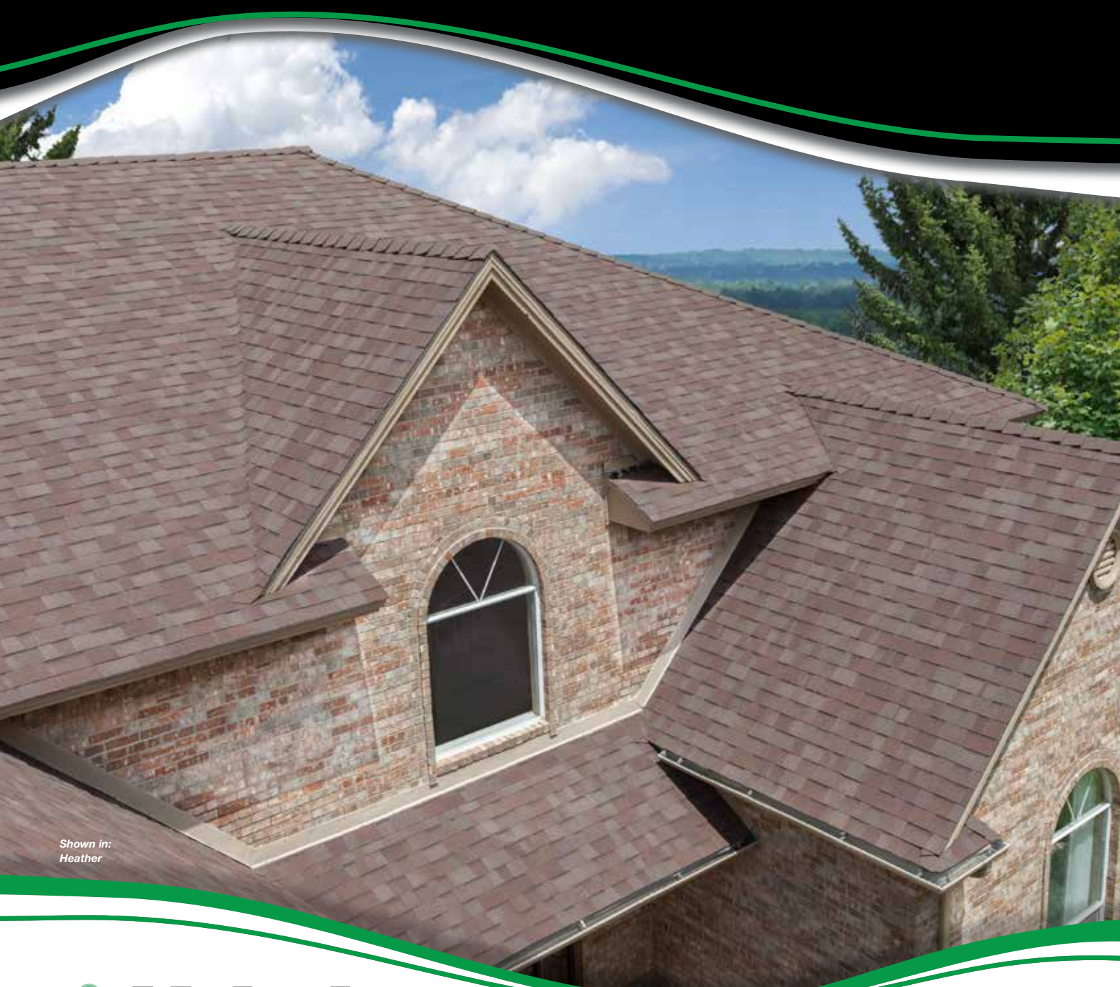
Shown in: Heather